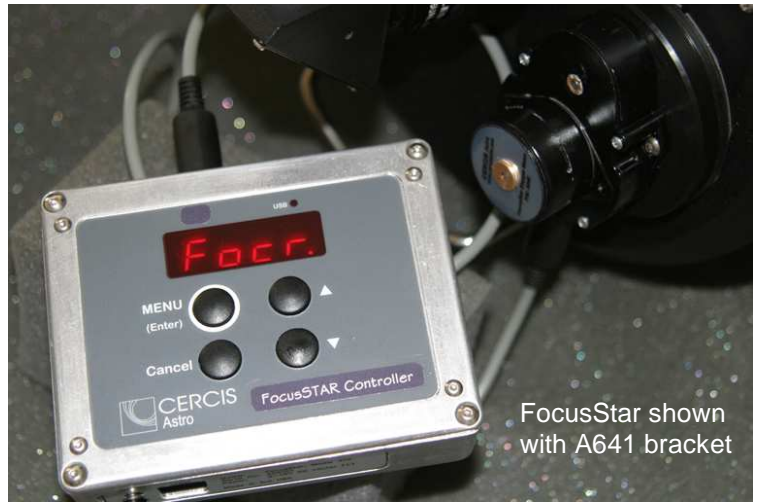
FocusStar shown with A641 bracket

Focus —FocusStar can focus either from a remote location using computer commands—or in the observatory using up/down keys while looking through the eyepiece or selecting from your presets. Brackets —Brackets for telescopes will be added as they are available. Yours not here? Please ask.