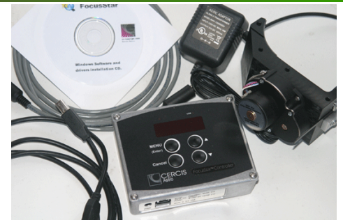
FocusStar (w/ A643 bracket and w/o Stepper Motor)